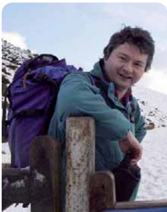
Alun Pugh AM

Minister for Culture, Welsh Language and Sport